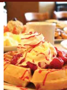
Waffle Ala Mode 9.29 Topped with vanilla ice cream and your choice of fruit.

Pick-A-Fruit Waffle 8.49 Cherry, blueberry, bananas, pineapple, georgia peaches or cinnamon apple.