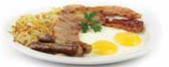
The EGG SAMPLER