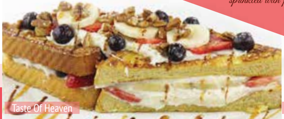
Taste Of Heaven

slices dipped in egg batter, sprinkled with powdered sugar.