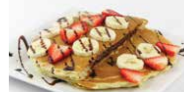
Strawberry Banana Stuffed Nutella 8.49

POTATO PANCAKES 7.49 House made Potato Pancake with Apple Sauce and Sour Cream.