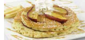
Caramel Apple Pecan 8.49