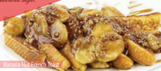
Banana Nut French Toast