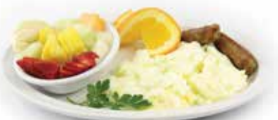
Matty's Fit 2 Egg

Two buttermilk pancakes or two half slices of french toast may be substituted for toast Fruit may be substituted for potatoes • Egg Beaters or egg whites: 1.25 extra