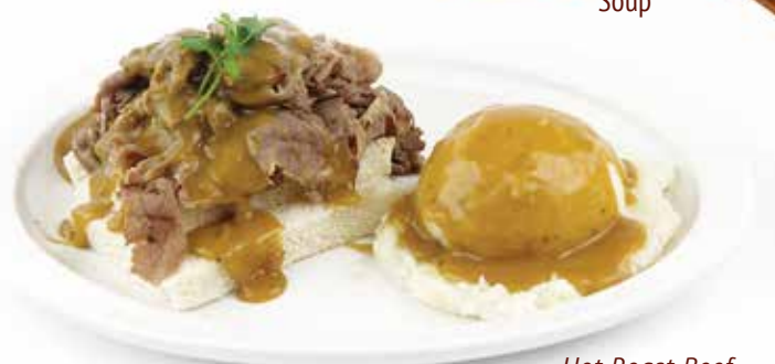
Hot Roast Beef