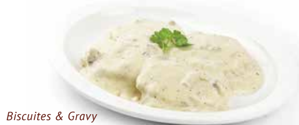
Biscuites & Gravy