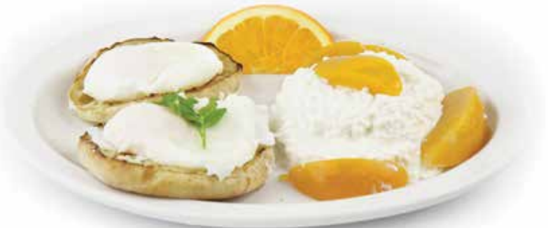
Matty's Health Club

8 Oz. Hamburger Patty Served with Cottage Cheese, Sliced Tomatoes, Hard Broiled Eggs, and Fresh Fruit.