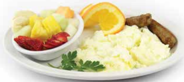
Matty's Fit 2 Egg

Scrambled egg whites served with 2 turkey links, seasonal mixed fruit and dry whole wheat toast.