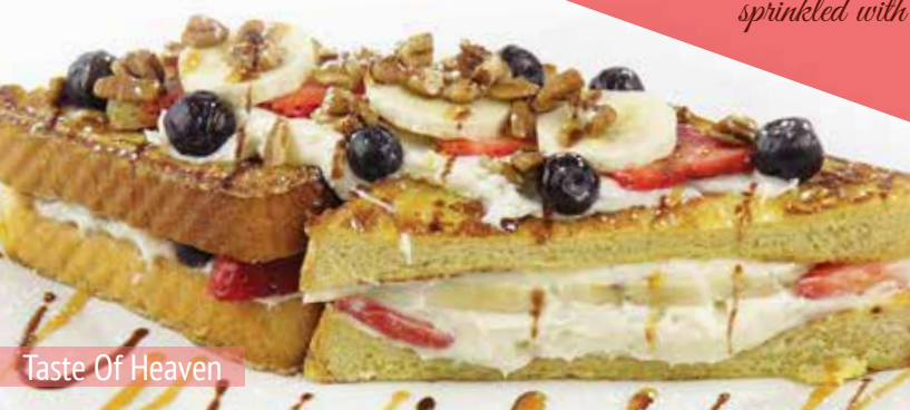
Taste Of Heaven

slices dipped in egg batter, sprinkled with powdered sugar.