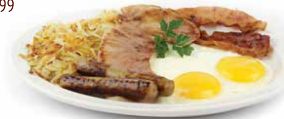
The EGG SAMPLER