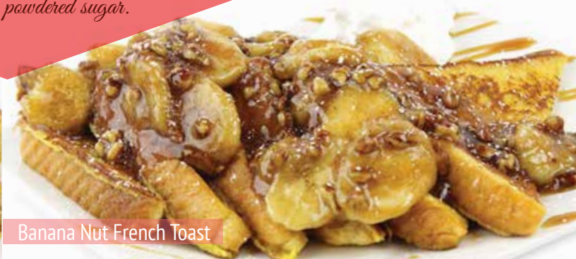
Banana Nut French Toast